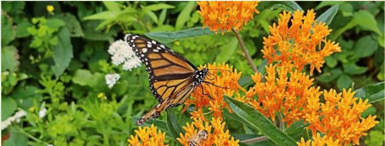
Above: Butterfly Weed

Every year, the Warren Garden Club donates milkweed plugs to our community. Beginning July 4 th weekend, they will be offered on a cart across the street from Borough Hall for a nominal donation. We encourage you to stop by.